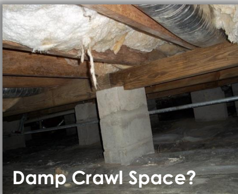
Damp Crawl Space?

FES Inc. Foundation Repair & Geotechnical Construction is a Full service geotechnical contractor servicing residential and commercial customers all over the Virginia, Maryland, Delaware, Pennsylvania, North Carolina, and the Washington DC area.